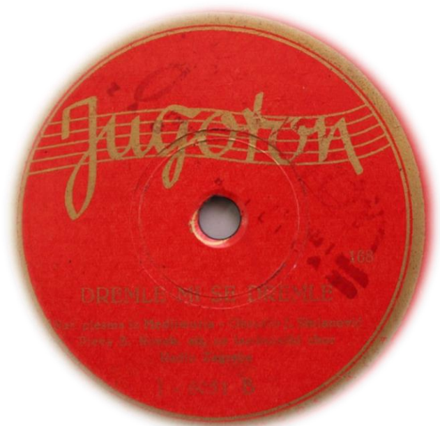
J-6051 Blanka Novak with Radio Zagreb's tamburitza ensemble 1949.