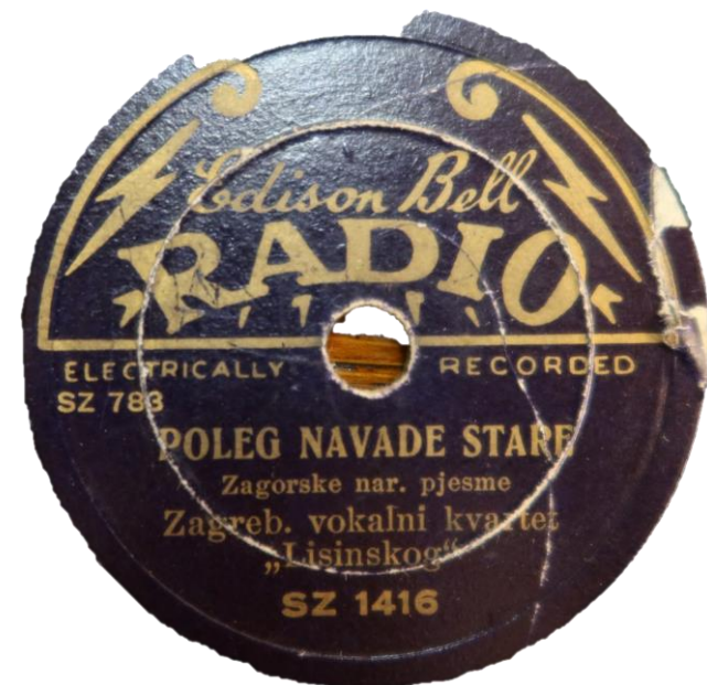
SZ-1416 Lisinski's vocal quartet from Zagreb 1929.