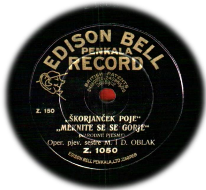
Z-1050 Oblak sisters 1927.